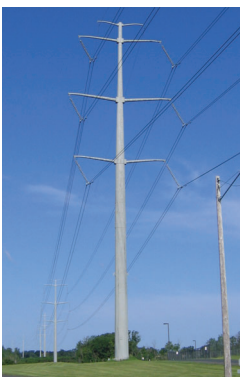
Double circuit single pole structure