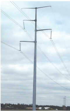
Single circuit single pole structure